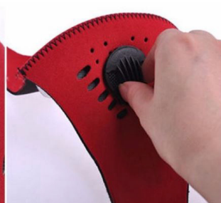
4 Replace the new filter, press "CLOSE" direction of rotation, replacement is complete