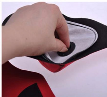
2 Press the "OPEN" indicator on the valve to indicate the direction of rotation