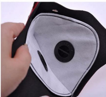
1 Open the mask and expose the filter's internal valve

The 'V' for the valve that manages the air flow.