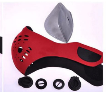
3 Remove the two valves and remove the filter